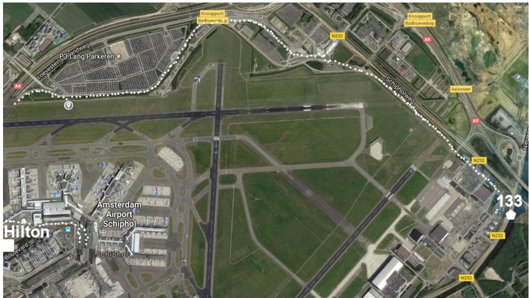
Picture of the area and bus route from the airport to Building 133

The bus stops across the street of the building 133 at Schiphol East.